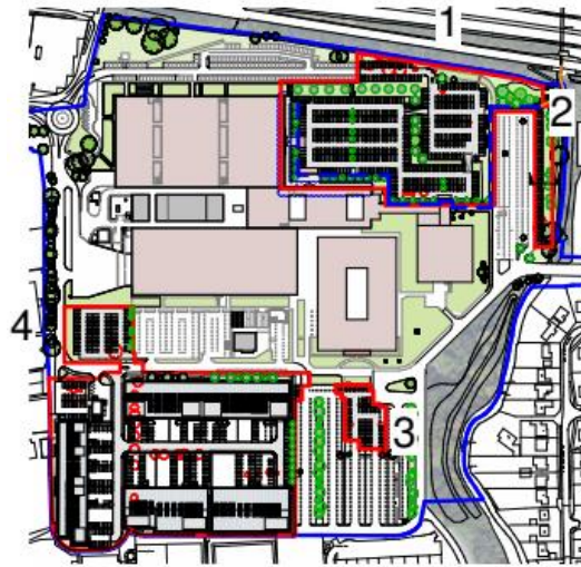
Key Plan Sheet 1